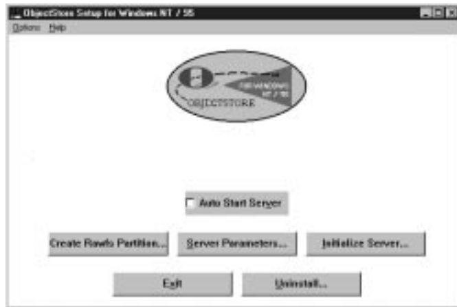
Figure 2-2. ObjectStore Setup Window