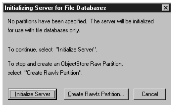
Figure 2-4. Initializing Server for File Databases Dialog Box

Note: Do not select Create Rawfs Partition from the ObjectStore Setup Window.